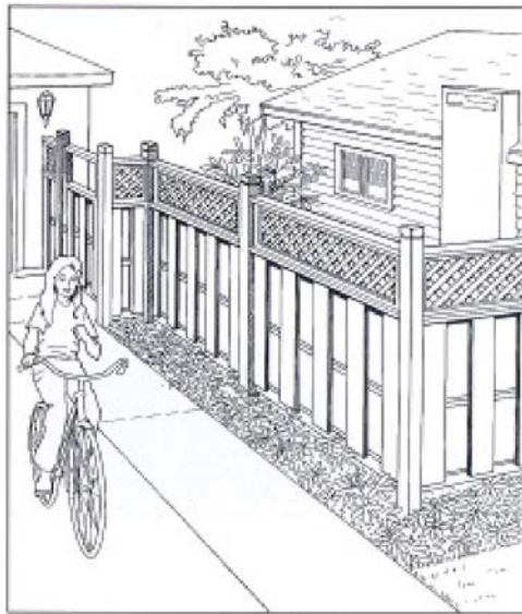
Privacy Fence with Lattice